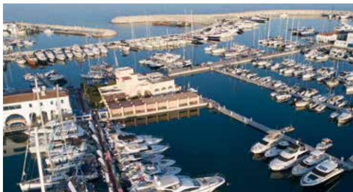
Photo Exhibition Sponsor

The Map Sponsor logo will be prominently displayed on all maps which will be printed and given to visitors at the information points. In addition, the Map Sponsor's logo will be placed on all signage which will be located at Limassol Marina during the exhibition.